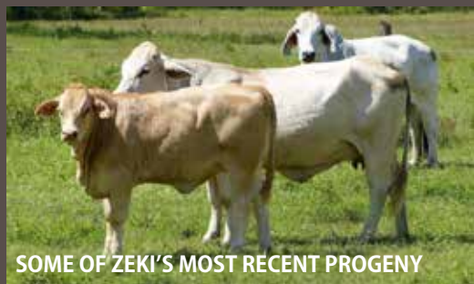
SOME OF ZEKI'S MOST RECENT PROGENY