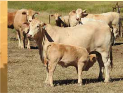
FIRST CALF HUNTINGTON HEIFER (BY HUNTINGTON EAGER BEAVER) WITH ROSEWOOD IDOL CALF