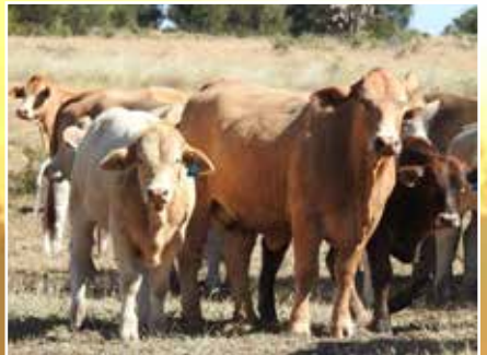
HEIFER AND POLLED BULL CALF BY WATTLEBRAY 264-3 (DON'T TAKE ANY NOTICE OF THE ONE BY THE NEIGHBOUR'S BULL)