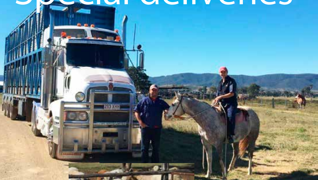
FROM TOP: MATT PULSFORD AND DAUGHTER REBECCA