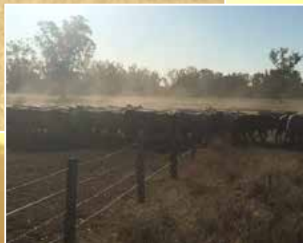
TURNING OUT FROM YARDS