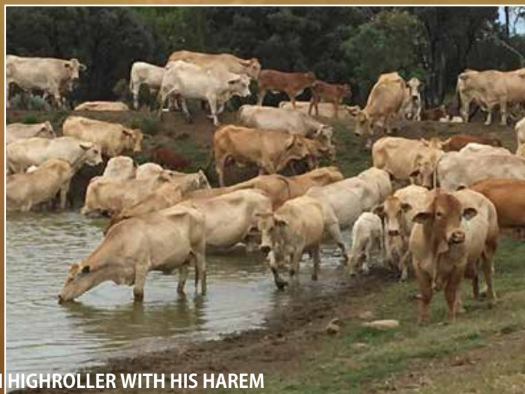
HUNTINGTON HIGHROLLER WITH HIS HAREM