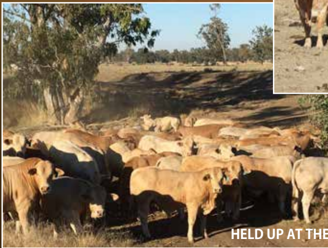
HELD UP AT THE CREEK CROSSING