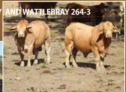
WILUNA HOW WORTHY AND WATTLEBRAY 264-3