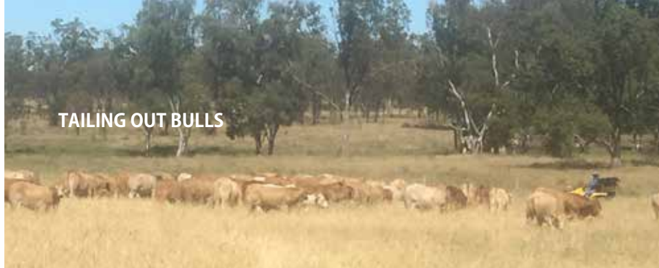
TAILING OUT BULLS